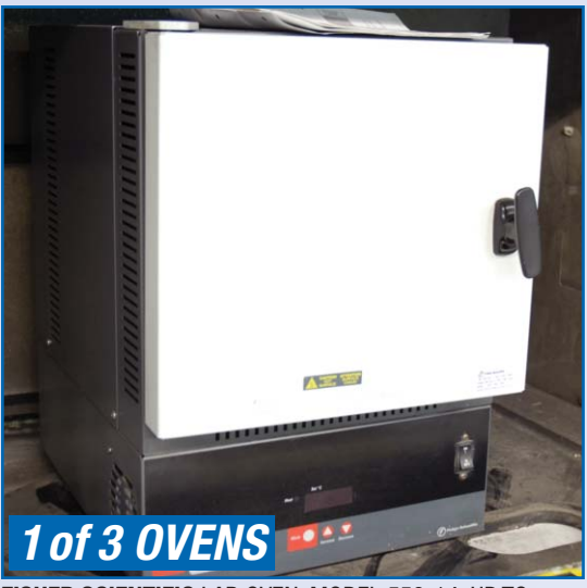
FISHER SCIENTIFIC LAB OVEN, MODEL 550-14, UP TO 2.025 DEG F