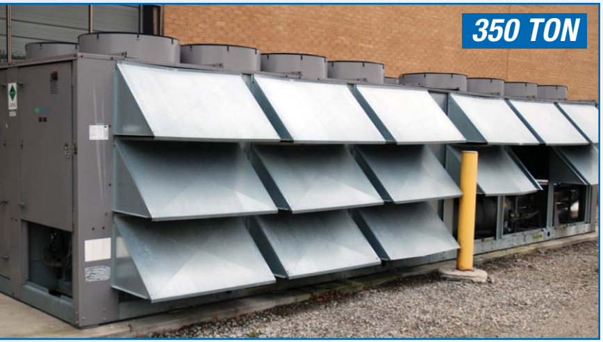
CARRIER 350 TON TURBINE CHILLER