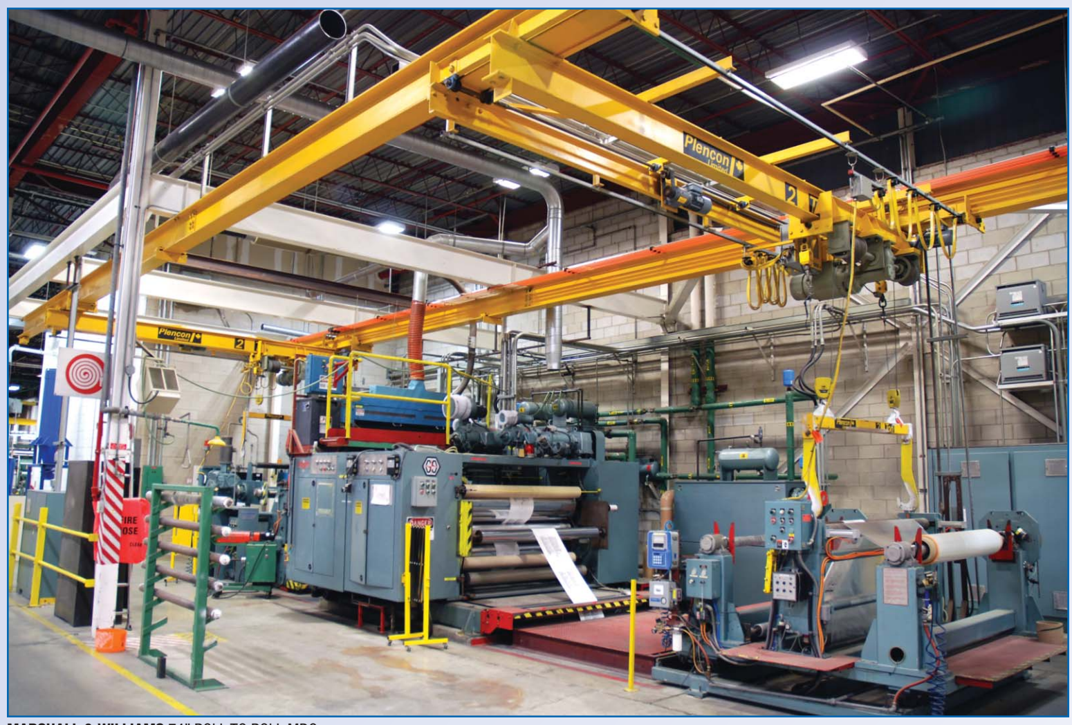
MARSHALL & WILLIAMS 74" ROLL TO ROLL MDO