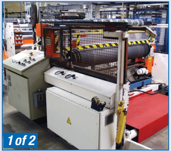
BRAMPTON 74" AUTOCUT SURFACE WINDERS