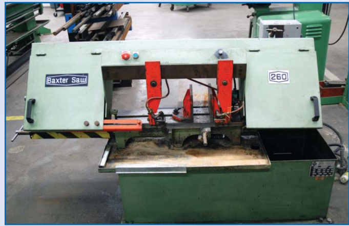
BAXTER MODEL 260 HORIZONTAL BANDSAW