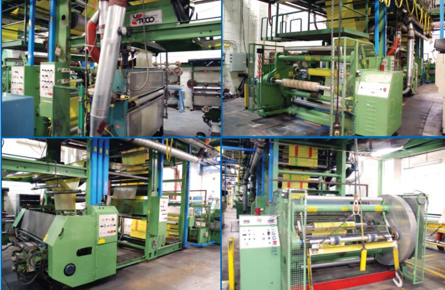
UTECO MODEL JADE 160, 6 COLOR CI, 1600 MM