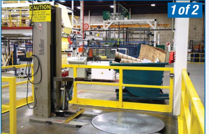
MULLER PALLET WRAPPER