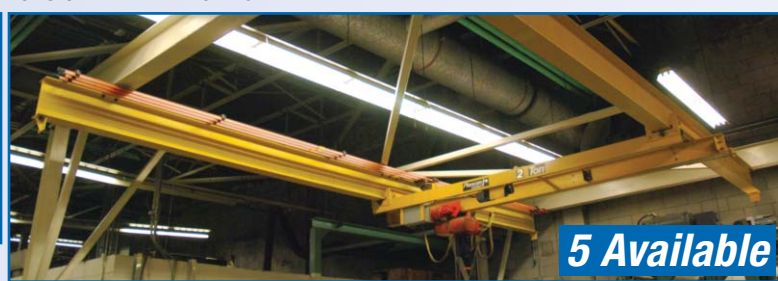
PLENCON 2 TON CRANE