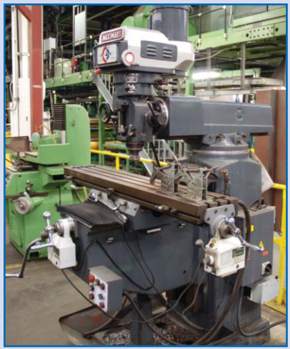
MAXIMART MILL, MODEL 4VS-S