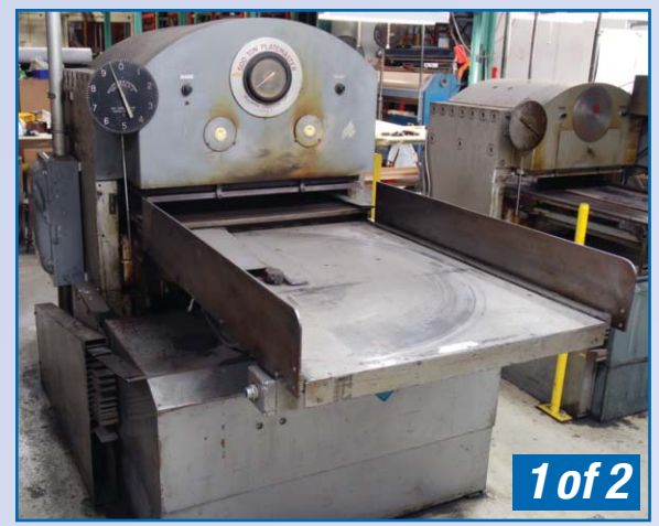
WILLIAMSON RUBBER PLATE VULCANIZER, 500 TON PLATEMASTER 36'