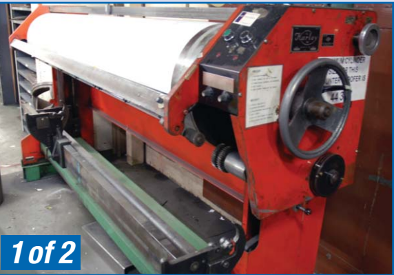
HARLEY MODEL P18100, 100" ROLLER