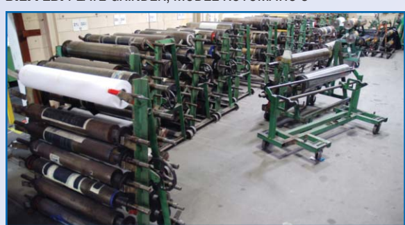
300+ ASSORTED PRINTING CYLINDERS