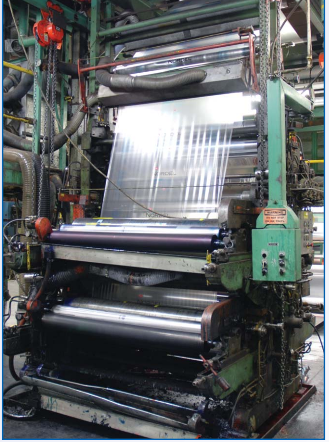
WOLVERINE 6 COLOR ROLL TO ROLL STACK PRESS, MODEL 61-6

Line 70 - WOLVERINE , 6 Color Stack Press, Model 61-6, 32" Repeat, Push Button Register, Hydraulic Continuous Inking, Gas Dry, 60" Unwind, Rewind, sn HLRE-1145