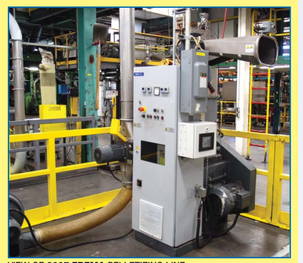
VIEW OF 2007 EREMA PELLETIZING LINE