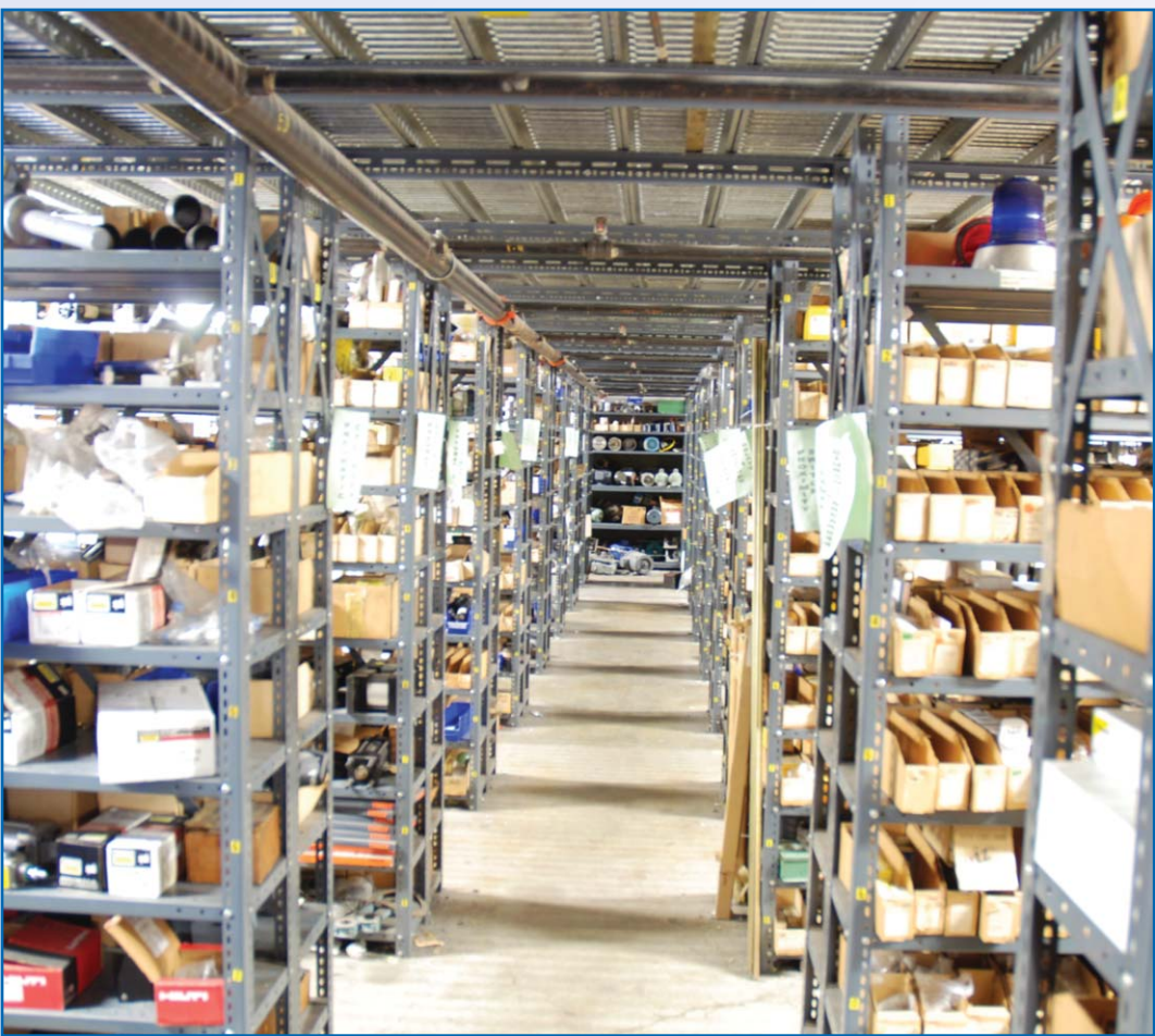
PARTIAL VIEW OF 3 LEVEL STORES ROOM