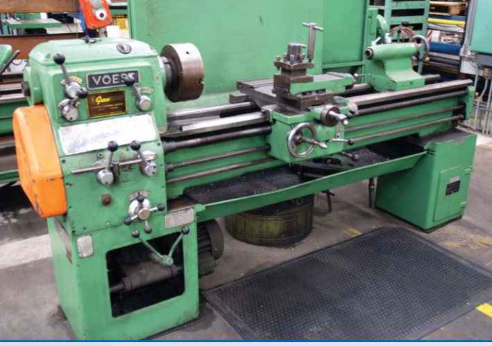
VOEST 18"X60" LATHE