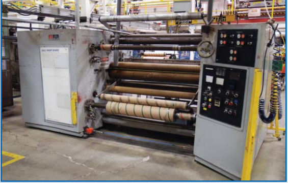
DUSENBURY 60" SLITTER, MODEL 815 HLM