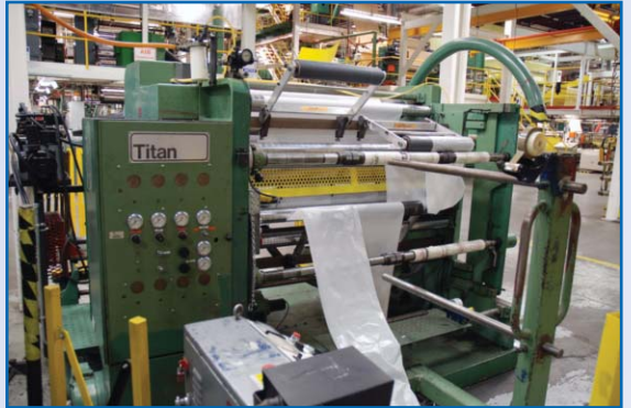
TITAN 60" CANTILEVERED SLITTER MODEL SR5