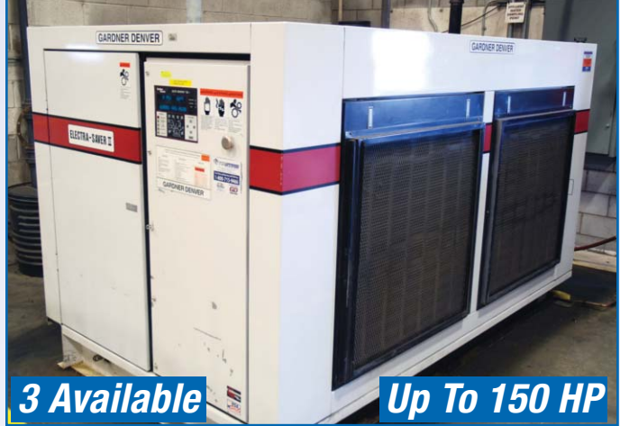
GARDNER DENVER AIR COMPRESSOR