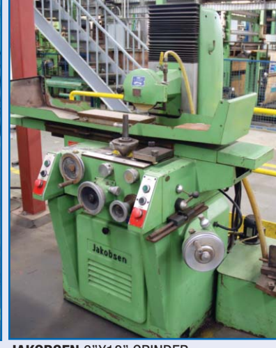
JAKOBSEN 6"X18" GRINDER