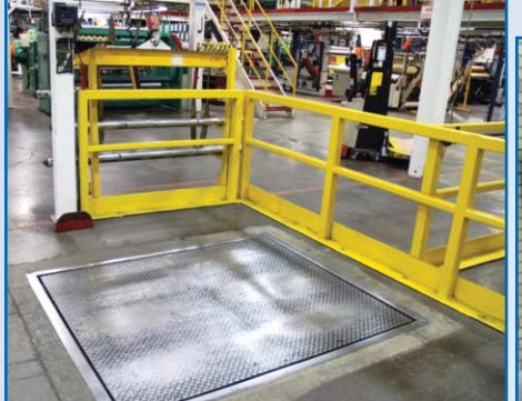
5'X6' FLOOR SCALE WORK STATIONS