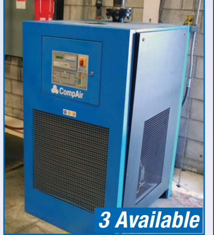
COMPAIR AIR DRYER