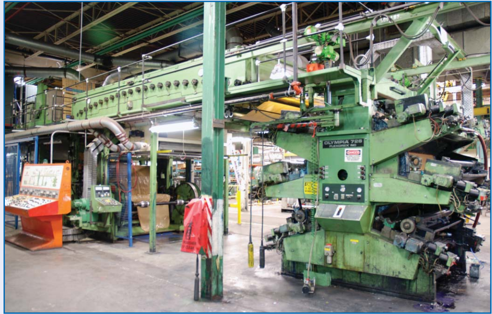
WINDMOLLER + HOLSCHER MODEL OLYMPIA 726 FLEXOREX 6 COLOR CI PRESS, 1400 MM