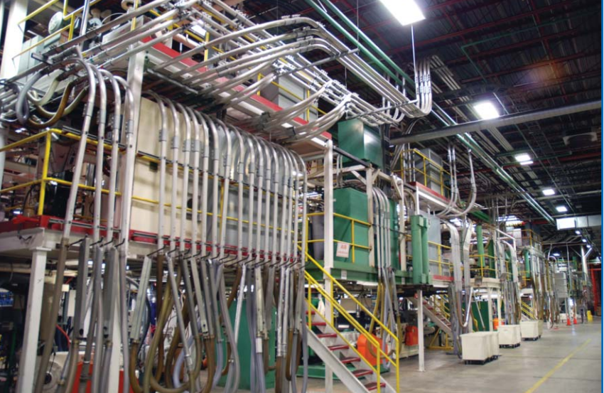
MATERIAL PIPING THROUGHOUT FACILITY