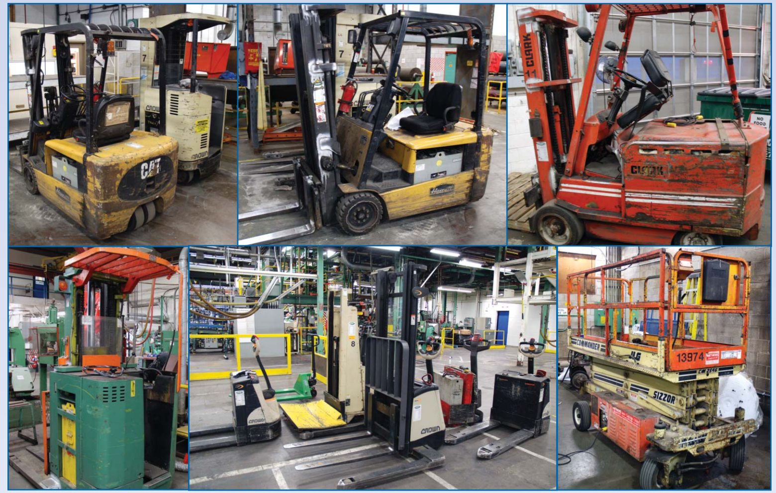
VIEW OF ASSORTED FORKLIFTS - UP TO 15,000 LB CAPACITY AVAILABLE