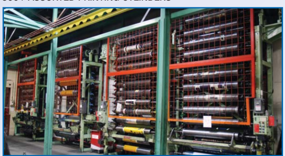
4 VERTICAL CYLINDER STORAGE CAROUSELS