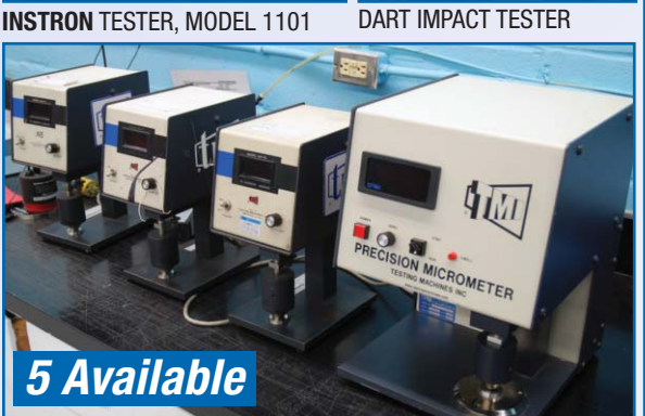
TMI PRECISION MICROMETERS