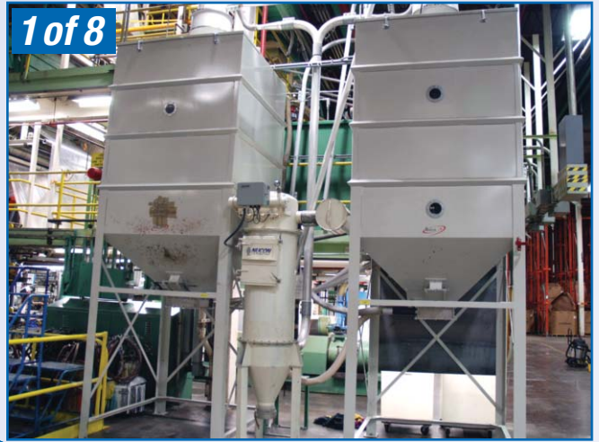
SURGE BINS & LOADERS