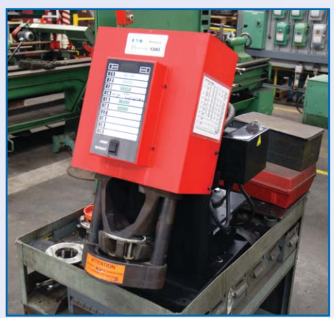
AEROQUIP PRO CRIMP 1380