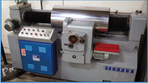
BIEFFEBI PLATE GRINDER, MODEL ROTOMATIC 3