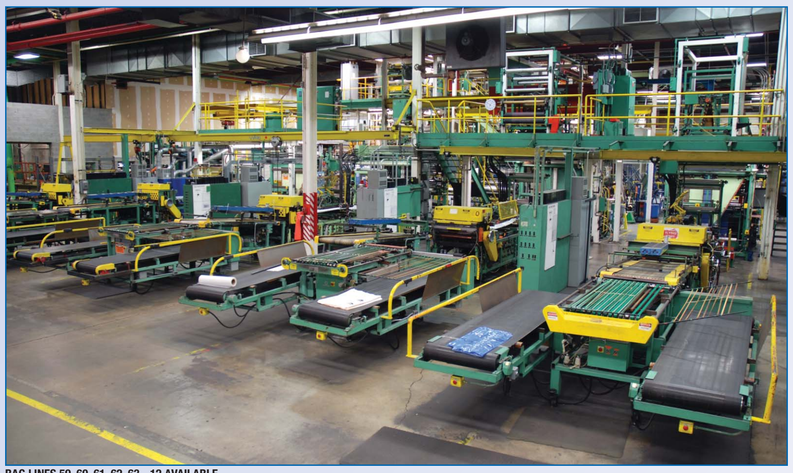
BAG LINES 59, 60, 61, 62, 63 - 12 AVAILABLE