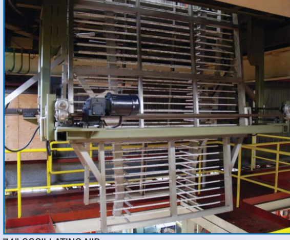
74" OSCILLATING NIP