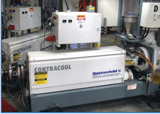
GEC EXTRUDER, 2" 30:1